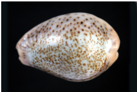
1. E. turdus pardalina , pink form; colored extremities and sides; E. Sinai

Erosaria turdus (Lamarck, 1810) is a very variable species, which is locally common in the Red Sea, Oman, the Persian Gulf and western India. Populations of the species in the Gulf of Aqaba can be distinguished as a subspecies Erosaria turdus pardalina (Dunker, 1852); they differ by having a larger shell with mostly elongated extremities. Shells of this subspecies are very variable and its 15 forms are already described in “Cowries of East Sinai”; some of these forms are rare whereas the others can be found more or less regularly.