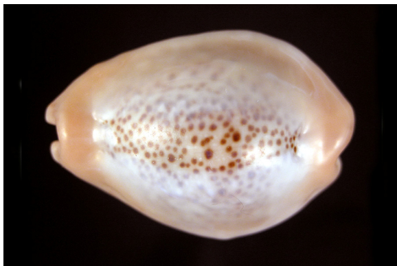
3-4. E. turdus pardalina , 41.6 mm, pink form; shell overcallused and tinged with pink; E. Sinai (all three shells from A. Singer collection)