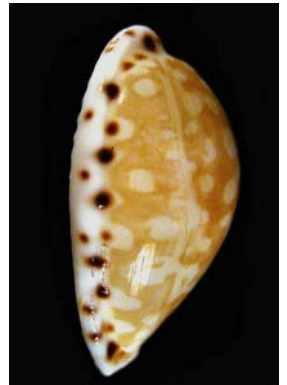
1-4. An unusual shell of C. cumingii (16 mm, Marquez's Is.) with a confused dorsal pattern, (obtained as C. astaryi ). Author's collection